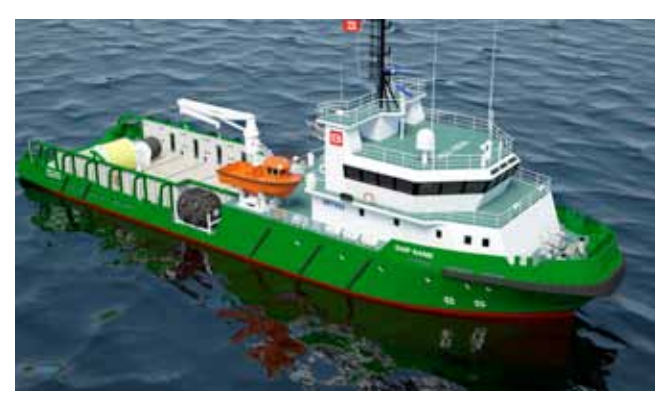
54m Seismic Support Vessels

smaller vessels building and repairs. Grandweld will relocate its offices to the DMC facility within three months.