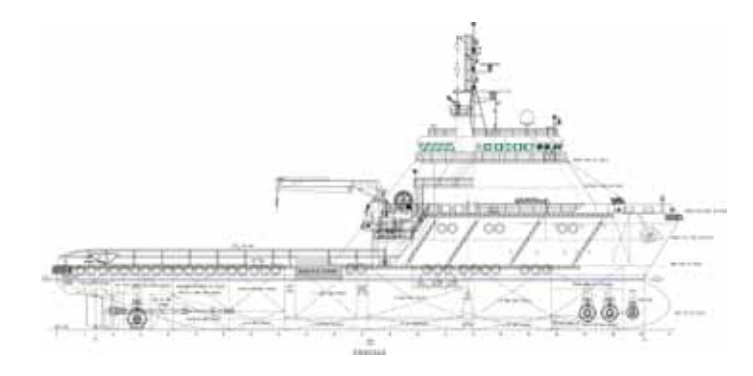
AHTS BP 90Tos

All large vessels construction will take place at the new facility of Grandweld Shipyards at DMC. Grandweld will continue to function from the old Jadaf yard but only for Aluminum and