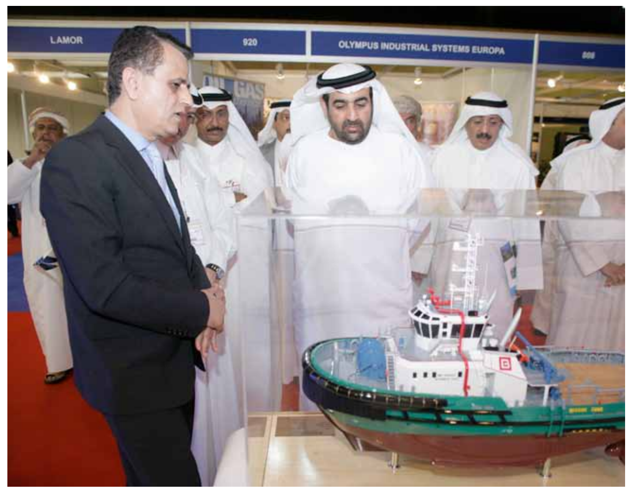
Dr. Rashid Ahmad bin Fahad, Minister of Environment and Water with Mr. Jamal Abki, Grandweld General Manager.

Grandweld Shipyards participated in Offshore Arabia conference and exhibition, which was held in Dubai International Exhibition Centre from 27 - 29 February 2012. The exhibition was inaugurated by Dr Rashid Ahmad bin Fahad, Minister of Environment and Water. Offshore Arabia 2012 was an important platform for networking, and showcasing, which allowed Grandweld to be present amongst key players in the offshore oil and gas industry such as Saudi Aramco, Kuwait Oil Company and Qatar Petroleum, and to showcase its various product and service capabilities which support offshore oil and gas industry.