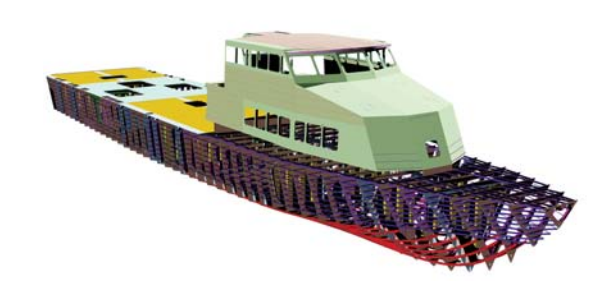
Detailed 3D Structural Models for efficient construction and structural integrity.