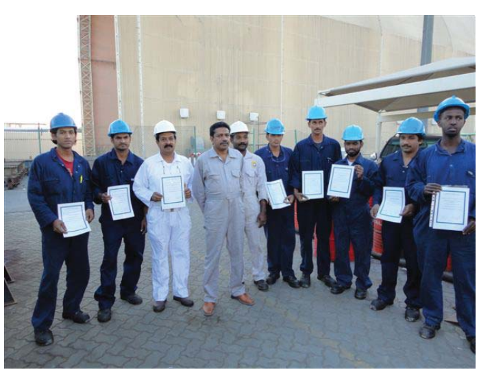
The Mechanical Team awarded.