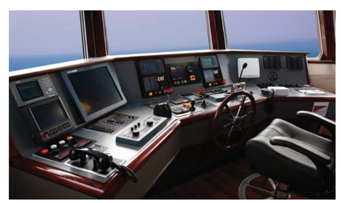
Modern interior of Al Nibras I.