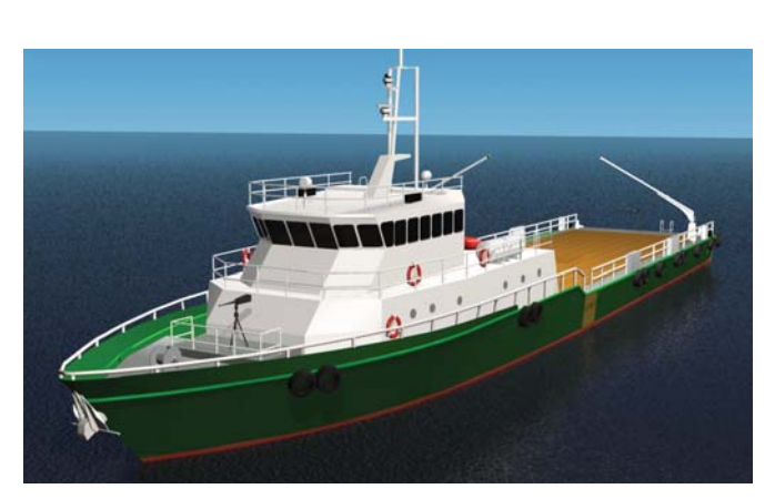
Conceptual Design tailored to the owners requirements.