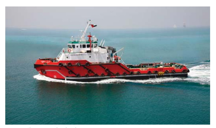
36m Utility Vessel, Al Nibras I.

We achieved two deliveries that are milestone achievements in the expansion of the company's portfolio. Firstly the trials for a new breed of specially designed utility vessels were successfully completed, and then most significantly, the first DP vessel designed by Grandweld was handed over to her client amidst great pomp and display.