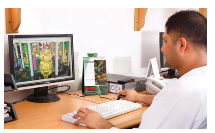
Collaborative design and management through 3D model reviews and simulations.