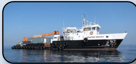
Stanford Service, 35M Utility Vessel

We completed few successful cross charters in the first quarter 2012 with more medium to long term charters in the pipe line. The tug " Blenda " was chartered in for a Rig Move with Dubai Petroleum. The tugs " Duma ", " Bofors " and " Kamarina " were chartered in for a rig move with Sagadrill Inc. " PB Provider " along with " Stanford Pride " successfully completed the move of rig " Jumana " in Abu Dhabi for National Drilling Co. (NDC). The " Dynamic Kareem " was chartered in to replace " Stanford Service " for the charter with Maritime Global Services for the operations in Offshore Oman.