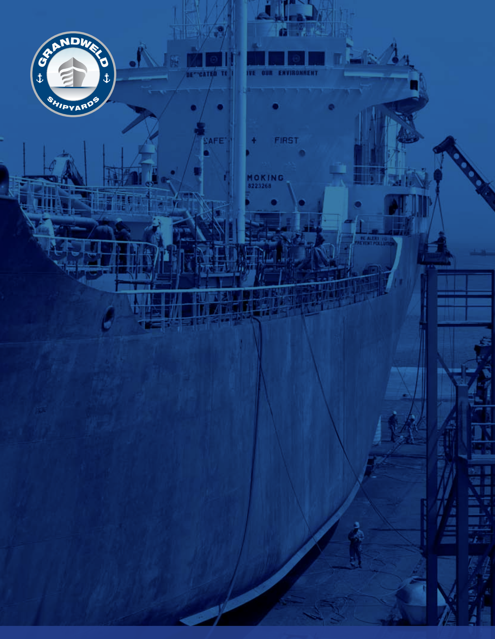
Ship Repair and Conversion